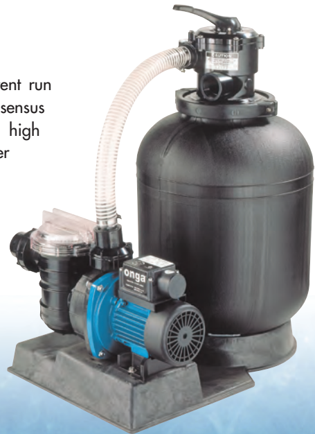
Sand Filter/Pump Package complete with Multiport Valve

Different pool manufacturers specify different run times for filter systems. The general consensus from pool professionals is that to ensure high water quality you should run your pool filter system for at least 8 hours a day. You should increase this during peak summer months to at least 12 hours per day. If your pool is heated you will possibly need to operate the circulation system for longer periods to allow the heater to achieve the desired pool temperature. If your pool becomes green or cloudy you will need to filter the water continually and backwash daily until the problem has been remedied. Shortening your filtration cycle will usually prove to be a false economy.