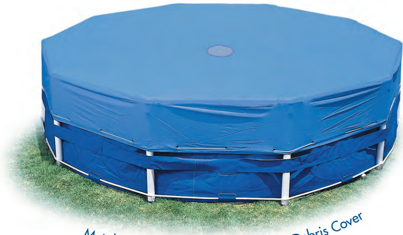
Metal Frame Pool Fitted with Winter Debris Cover

If your Above Ground Pool is the inflatable type, you will probably be best to empty the water and store the pool for the winter months.